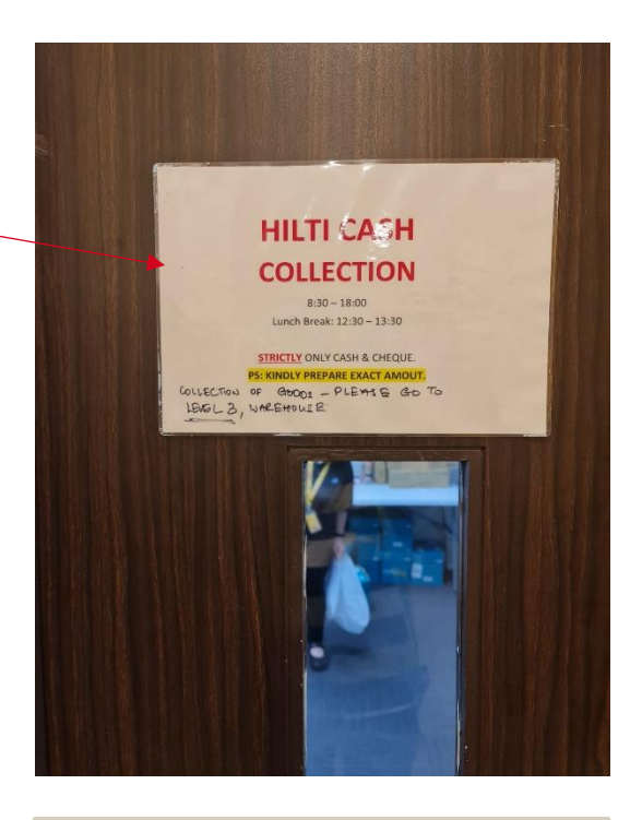
Please make your cash payment here